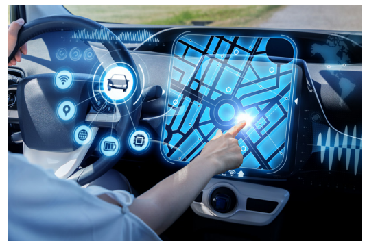
Figure 1. Autonomous driving capabilities will require faster data rates and more bandwidth.

Not all serial link technology, however, is equipped to meet emerging challenges around high bandwidth, interconnect complexity, and data integrity. Given the harsh operating environment of a vehicle, particularly where electronic components are concerned, serial link technology must deliver the speed, reliability, and low latency to push voluminous amounts of data through to trigger real-time responses. Let's take a closer look at the different automotive applications that rely on high-speed serial links, along with their unique bandwidth requirements. In this paper, we will also compare the capabilities of the underlying serial link technology required to transport all of this data.