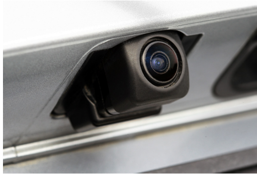
Figure 2. Rear-view cameras will among the roughly one dozen cameras that future cars will have to enable applications such as ADAS and infotainment.

ADAS applications rely on the input of a variety of sensors, including radar, lidar, and cameras. Data from these sensors must be collected and processed in real time by sophisticated software algorithms running in a microcontroller unit (MCU) or electronic control unit (ECU). The resulting output triggers the vehicle to take some corresponding action or alert the driver to do so. Vehicular camera systems, in particular, have very high data rates. For example, in a surround-view system, each camera typically boasts a video stream with 1280 x 800 pixel resolution and a frame refresh rate of 30 f/s. 2 What’s more, every IC on a camera module must be able to withstand stringent temperature ranges and different environmental conditions, providing the durability to perform reliability for the life of the vehicle. Limited