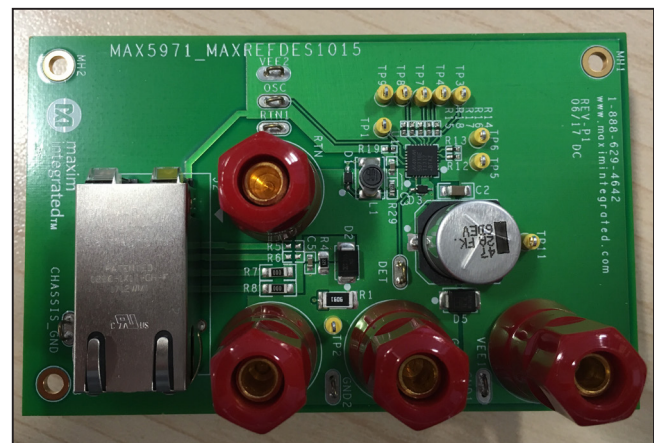
Figure 1. MAXREFDES1015 hardware.