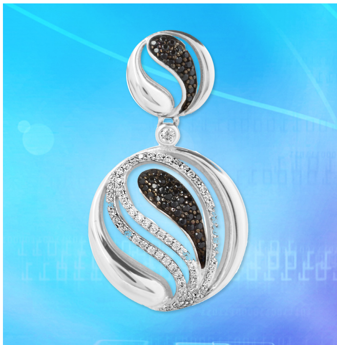
Figure 1. Smart Jewelry

In this article, we will discuss the design challenges encountered when selecting the GPS' low-power LNA for the smart jewelry system.