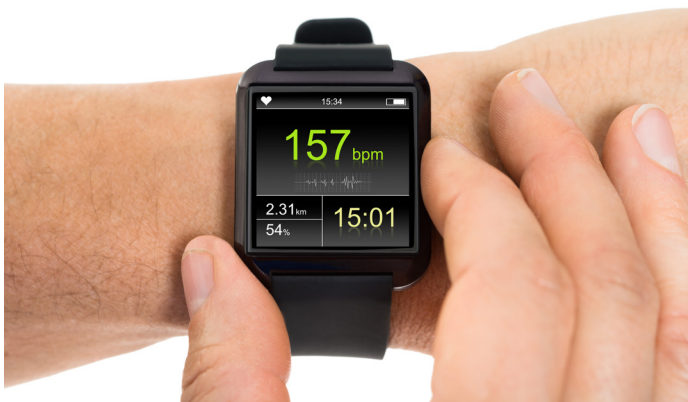
Figure 1. Wrist-Worn Health and Fitness Monitor

We'll review the conventional approach to their design and introduce an innovative solution that enables a higher level of accuracy while consuming less power and space than has been possible until now.