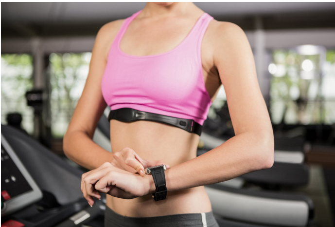
Figure 1. Wrist- and Chest-Worn Health and Fitness Monitors

It's possible that as you read this you're one of the many people wearing a health or fitness monitor (Figure 1). Wearable devices, whether worn on the wrist or on the chest, have proliferated in recent years almost to the point of ubiquity. Wearables offer many features (calorie count, heart rate, pedometry, etc.) that have become broadly homogenous, with an equally indistinct range of software applications available to perform custom analysis and interpretation.