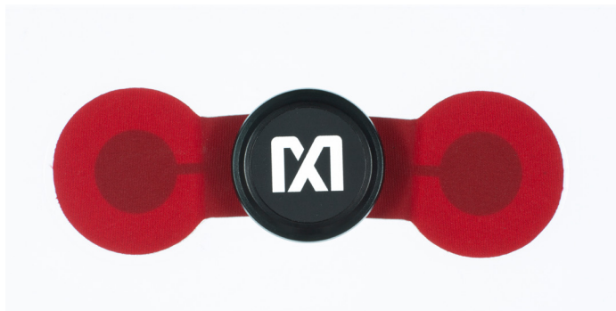
Figure 3. The MAX-ECG-MONITOR Evaluation and Development Platform

Wearable health and fitness product developers looking to include ECG functionality now have an alternative option in the form of a fully functional, evaluation and development platform (Figure 3). This is a complete wearable ECG monitor, based on an ultra-low-power, clinical-grade biopotential analog front-end (MAX30003).